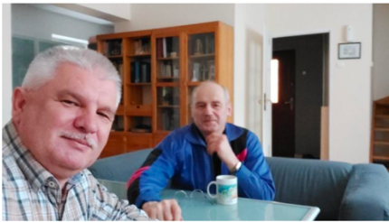
Each week I have opportunity to meet pray and drink coffee with man of influence