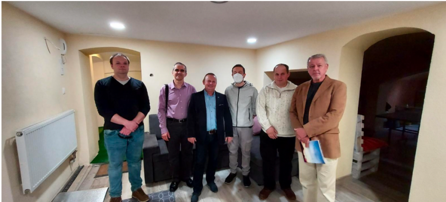
Our man's prayer group before first Sunday Service