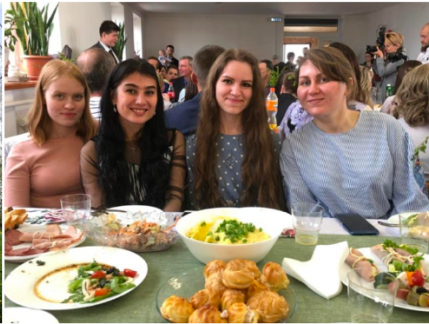
Wedding in Kazan Russia