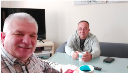
We eat and play we pray and laugh we seek God's grace for people we serve